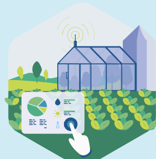
Digitalization and Innovation