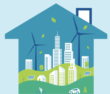
Affordable and Attainable Housing and Innovative Living Spaces